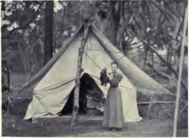
CAMP AT LENAHEL